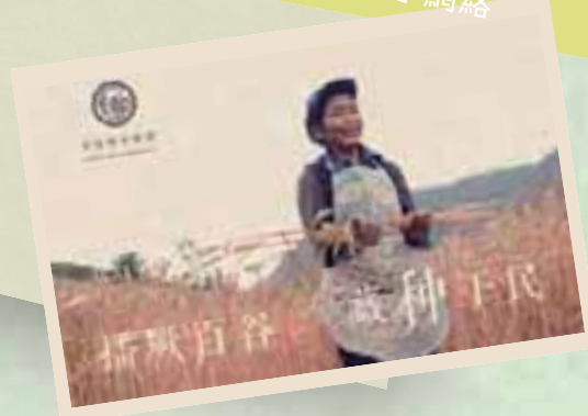
Farmer Seed Network 農民種子網絡