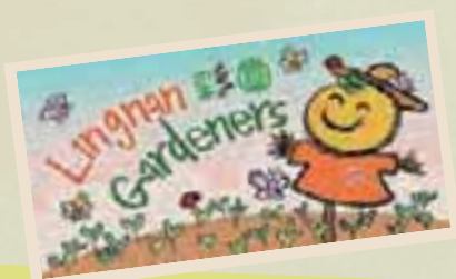
Lingnan Gardeners – transition campus 嶺南彩園-校園轉型