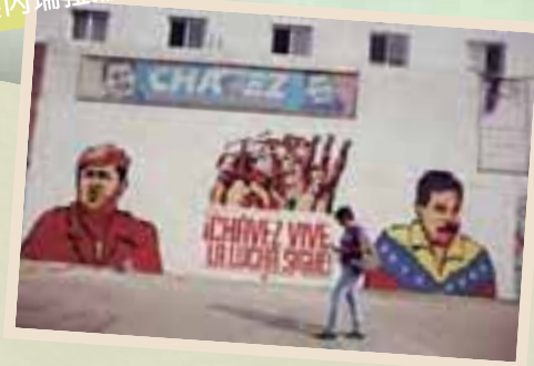
Venezuela: Social Achievements of the Bolivarian Revolution 委內瑞拉: 波利瓦爾革命的社會成就