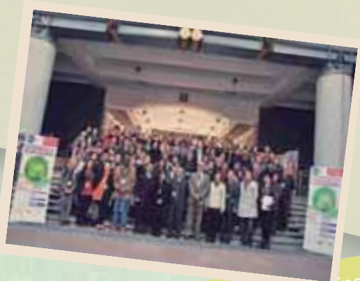
South South Forum on Sustainability 南南論壇

SS7S6 Skylight Square Exhibition (Posters and Photos) 28 June—3 July