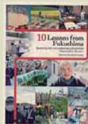
Fukushima Nuclear Disaster 福島核災

SS7S6 Skylight Square Exhibition (Posters and Photos) 28 June—3 July