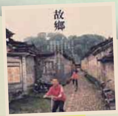
Devotion to Homeland Action 愛故鄉行動