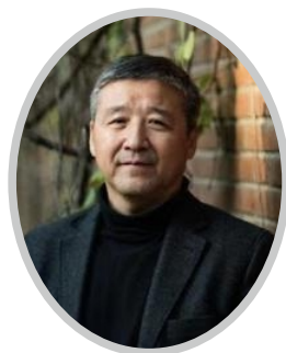
汪晖 WANG Hui

清华大学首批文科资深教授、清华大学人文与社会科学高等研究所所长、教育部长江学者、第12届全国政协委员