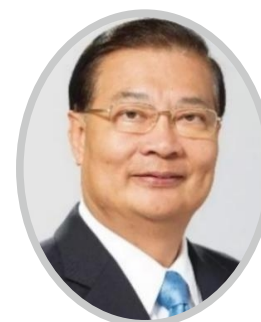
谭耀宗 TAM Yiu-chung, 大紫荆勋贤、金紫荆星章、太平绅士

Executive Director, New Paradigm Foundation; Advisor, Chinese Association of Hong Kong & Macao Studies