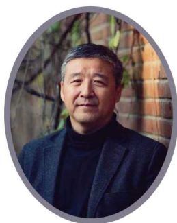
WANG Hui 汪暉

Director, Tsinghua Institute for Advanced Study in Humanities and Social Sciences, Tsinghua University, China. 清華大學人文與社會科學高等研究所所長。