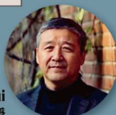
Prof. WANG Hui 汪暉教授

Director, Tsinghua Institute for Advanced Study in Humanities and Social Sciences, Tsinghua University 清華大學人文與社會科學高等研究所所長