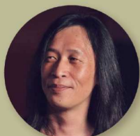
Dr. YAU Lai To, Herman (Film Director) 邱禮濤博士 (電影導演)