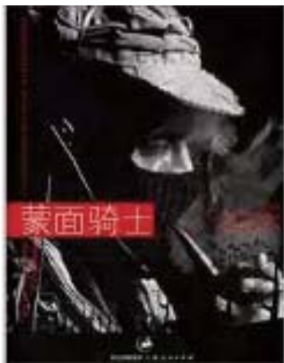
Book cover of The Masked Knight, published in China in 2006.

otic warfare and the cultural traditions in Mexican literature. She describes the caracole as “an important image of metaphorical and philosophical richness in Mayan culture, an image of folding inwards and unfolding outwards, one bend after another leading one inside and guiding one outside, a probe into the heart and a gaze of the vast world, with the sound of waves residing in it, with calls for action blowing from it. In, and out.” (Dai and Lau 2006: 41)