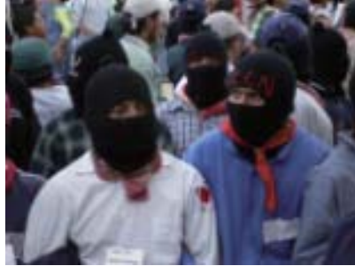
9 de agosto de 2003. Security guards identified by the handwritten notes on their chest. Oventic, August 9, 2003.