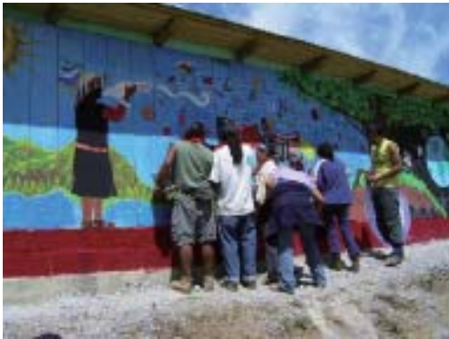
Oventic, 9 August 2003. Artists collectively painting.