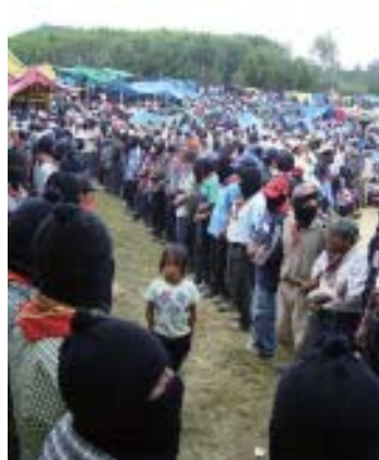
A little girl strolled in an area cordoned off by a human wall of security guards. Oventic, August 9, 2003.

The piece of paper with handwritten words might be interpreted by modernists and developmentalists as a sign of poverty and scarcity, almost synonymous with ignorance and backwardness. Yet for me, and surely for the Zapatistas, it is a proud sign of self-governance. Why should money be spent on uniforms for security guards or soldiers, when the communities prioritize building schools and clinics, training their own teachers and medical personnel, improving production, keeping bees, and protecting the forests? The Zapatistas have made a collective choice, making a distinction between need on the