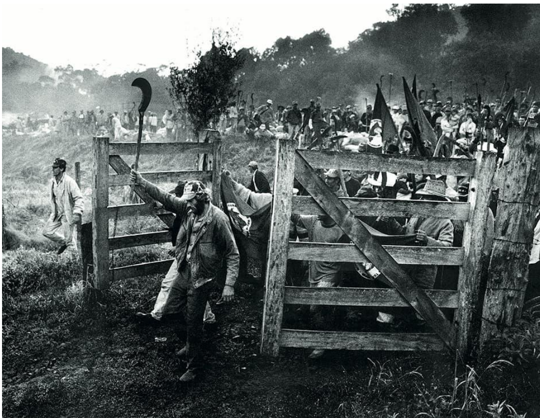
Sebastião Salgado, The struggle for land: the march of a human column , 1997.

reform is based on new paradigms: producing healthy food for all based on an agroecological model that is in harmony with nature and that protects water and fights against inequalities and environmental crises such as climate change. This new agrarian reform will also produce food using agroindustry and scientific knowledge to support our food sovereignty. In other words, each region or territory will produce its own food, avoiding dependence upon international trade with transnational corporations. We will carry out international trade of food only with the surplus that is produced after ensuring that all of our people are fed. We will value local cuisine and the culture of our people. We will guarantee access to education for the entire population, including in the countryside. This popular agrarian reform will benefit not only the peasantry but the entire population – much of which is already living in cities.