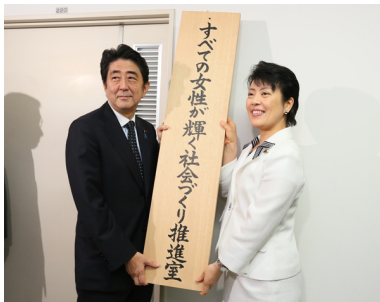
Establishment of Office for the promotion of building a society where all women shine

[Chinese Heart: The Paradox of the Japanese Spirit].” This is unbelievable. This notorious right-wing thinker is appointed to a key position at NHK. The first thing a coup d’état administration does is to occupy the controlling heights, especially asserting control over broadcasting. This is the Abe methodology, grabbing state power in what amounts to a virtual coup d’état.