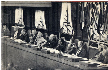
International Military Tribunal for the Far East, 1946

Commission (which would have the authority to decide policies for the occupation of Japan) could be set up and issue a directive to prosecute the emperor. The draft constitution was comparatively democratic, with content that would not raise objections among the public in either the Soviet Union or the US. That constitution was adopted, so the postwar emperor system is often referred to as an American-made system.